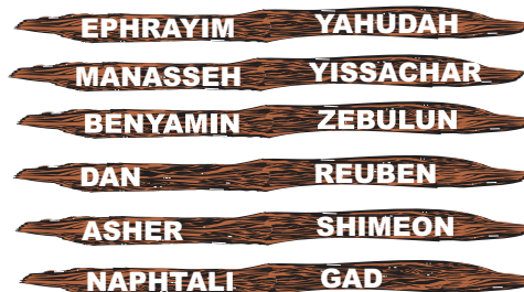
The 6 Sticks of the United Kingdom

Each tribe, comprising the pair, is dependent upon each other for expansion/blessing. The team of Yissachar and Manasseh secure our efforts and labors by transferring the value of labors into other properties that do not fade. All that we achieve is deposited into Manasseh. From the composite values assembled in Manasseh the tone of our labor is affected. We labor not for perishable things, but eternal principles that are not subject to the corruption of the world. The world is continually changing as it is supposed to, for it is designated for transformations to occur.